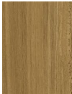
570 Western Blackbutt