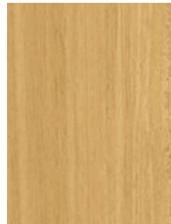
545 New Eng Blackbutt