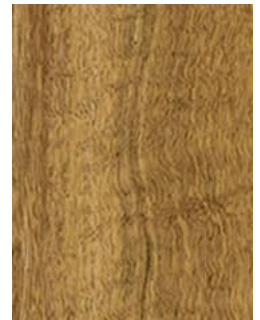
555 Grafton Spot.Gum